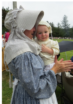
Battery I friends at the dance.