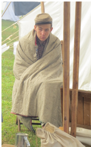
It was cool enough in the morning to need quilts!