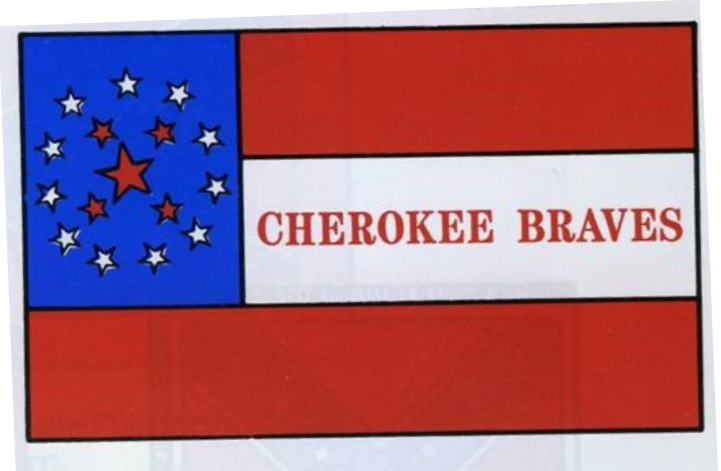
Figure 63: Trans-Mississippi Department, Cherokee Nation.